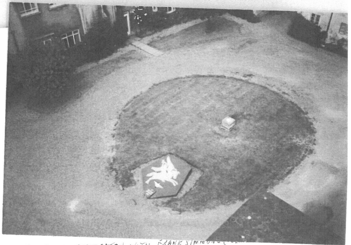
STARTING RESTORATION WITH FRANK SIMMONS