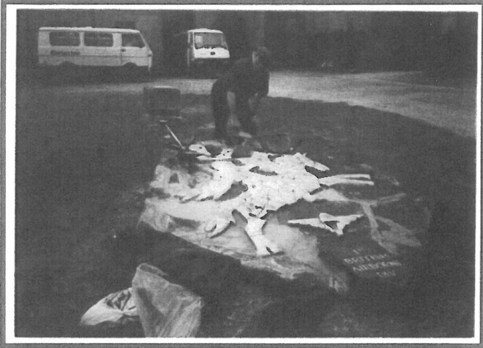
FRANK AT WORK 2004